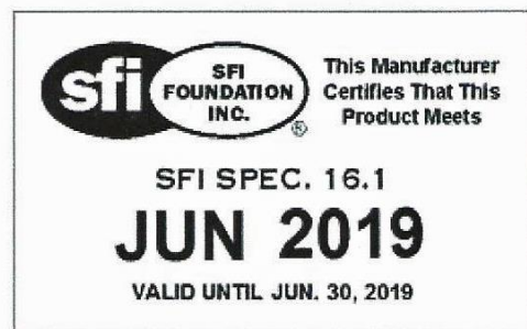
SFI Labels Available Jan. 1, 2017